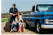
50 Miles to Empty