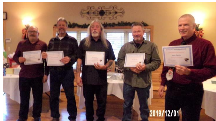
Our Ride Leaders